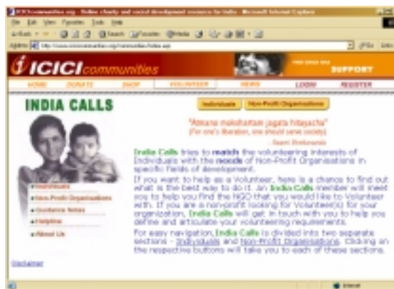
Figure 5 ICICI communities - On-line volunteering

Charitable services are also available to regular customers in India, through a set of services called ICICIcommunities, which enable donations and even enable people to sign up for volunteer work, as illustrated in Figure 5 .