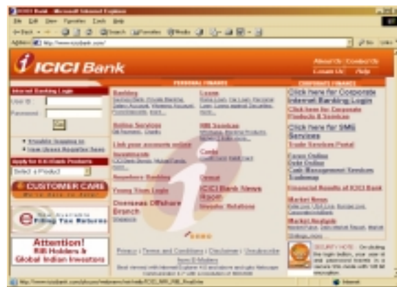
Figure 2 ICICI Bank Home page

saffron : considered auspicious amongst the Hindus, Sikhs, Jains and Buddhists, a militant colour signifying a fight against injustice among Sikhs.