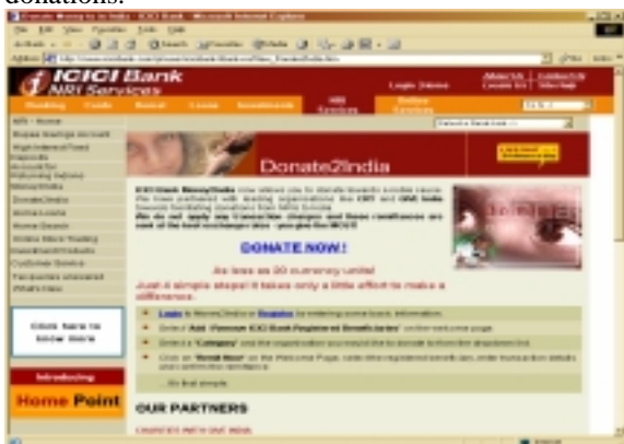
Figure 4 ICICI Bank - Charity Services for NRIs

Giving to Charity is important in Indian society, and banks afford an opportunity to make donations. Amongst Hindus, it is common to donate money for philanthropic activities. Hinduism emphasises that if money is donated for good causes, the money will grow. Bricks and mortar banks offer this, and this is replicated on the Web site through the Donate2India service on the NRI site. This is shown in Figure 4 . This page (not shown, needs scrolling) lists a number of charities to which the NRI may wish to make donations.