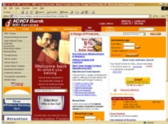
Figure 3 ICICI Bank - NRI Services